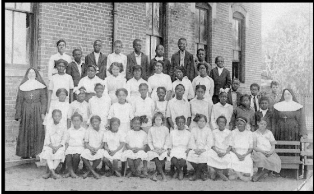
St. Benedict the Moor Students, 1903.

Located on this site was the former St. Benedict the Moor School, a Catholic school for black children that was one of the most important buildings associated with black history in Tampa. The property was purchased for $600 on March 15, 1900. The school, a two-story brick building, was completed several years after the acquisition of the property. It housed four classrooms and an auditorium that also served as a chapel. St.